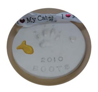
({\sf ClayPaws} {\tt B} {\tt Kits available at www.veterinarywisdomfor petparents.com})